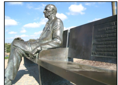
Jan Karski Bench in Survivors' Park, Łódź Ławeczka Karskiego Park Ocalałych Łódź