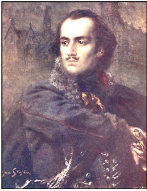
Kazimierz Pułaski by Jan Styka (1858 Lwów - 1925 Rome)

Wisconsin Public School Observance Days: Mar 4 is Casimir Pulaski Day in Wisconsin