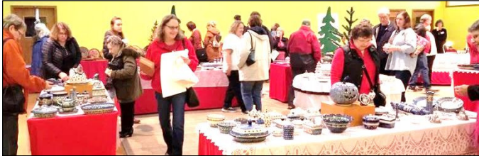
Photos from PHCWI's FB by Kasia Virgell - Dziękuję Kasia! In BOLD = in picture. See more pictures on FB + website.

Please tell us if your name was inadvertently left off our list!