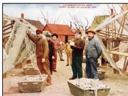
postcard from Milwaukee Public Library