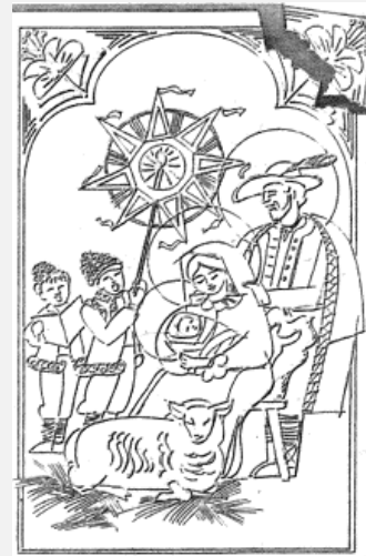
A large paper star mounted on a pole is carried by traditional caroling parties.

GVYAHZ-dah kaw-lend-NEE-chah - caroler's star