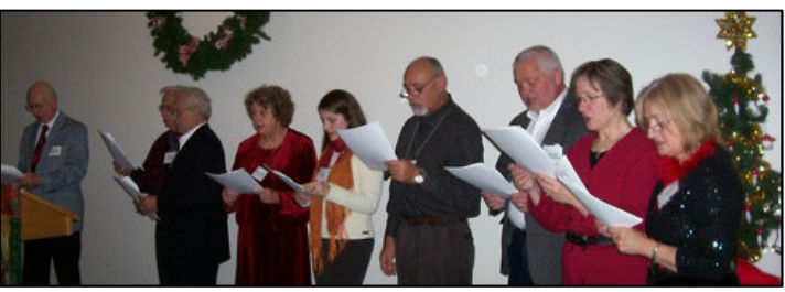
Kolędy led by the Polish Choir at 2010 Wigilia

The Wigilia is the most traditional of our club's events. It is for club members, and you are welcome to invite friends and family. Again this year it is held at the Zor Temple, with food catered by Queen Anne's Catering, makers of the delicious Polish Plates at our Bazaar. Zor Temple is near West Towne Shopping Center at 575 Zor Shrine Place. From the West Beltline: EXIT 254 on Mineral Pt. Rd, toward West Towne 0.4 mi. R Donofrio Dr 0.2 mi - L onto W Towne Way 1st R onto Zor Shrine Pl A drop off area is available.